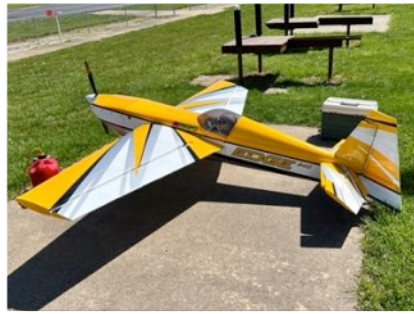
Duane Hulen's Big Bird