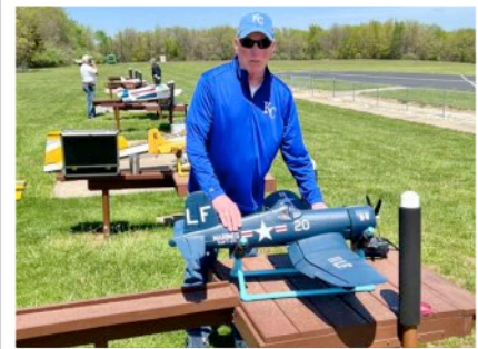
Corsair (Forgot Pilot's Name)