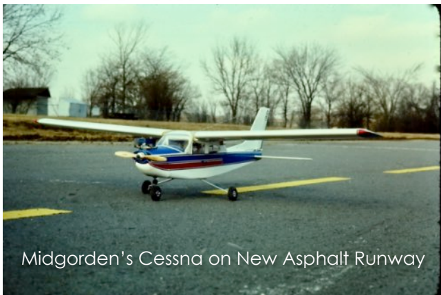
Midgorden's Cessna on New Asphalt Runway

As planes became more powerful and sophisticated, in 1979 KC/RC installed the asphalt runway further toward the south.