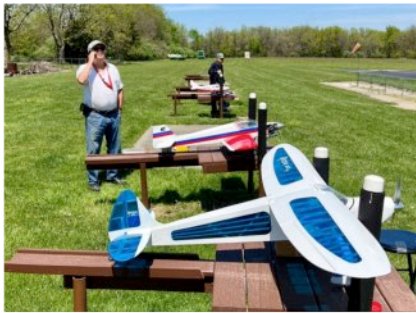
Enjoying a Great Day