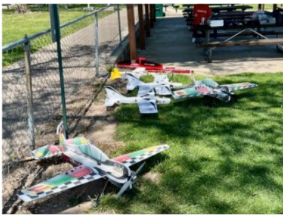
Gaggle of Foamies