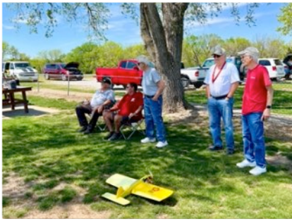
UKE Flyers Waiting Turn