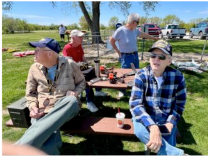
Part of the Gang