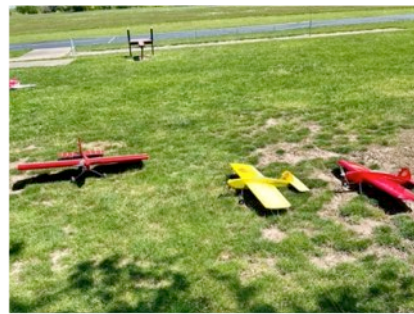
UKes Raring to Go